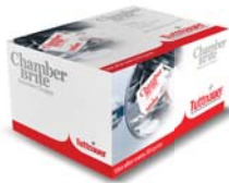
Chamber Brite Autoclave Cleaner