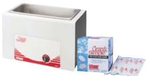
Clean & Simple™ Ultrasonic Cleaners and Tablets

Documents: date, time, temperature, pressure.