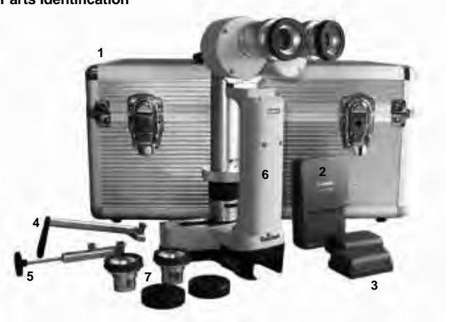
Figure IS-01, PSL and Accessories