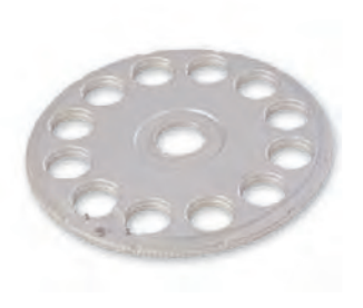
Precision machined, industrial strength aluminum lens dials